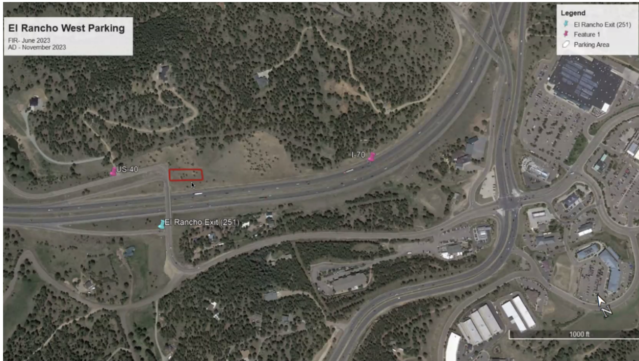
(Pictured above: Location of El Rancho Parking Lot at Exit 251, Pictured below: Initial design for the El Rancho Parking Lot)